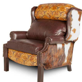
Wing Back XL 982

LEATHER CREATIONS CUSTOM-CRAFTED LEATHER FURNITURE